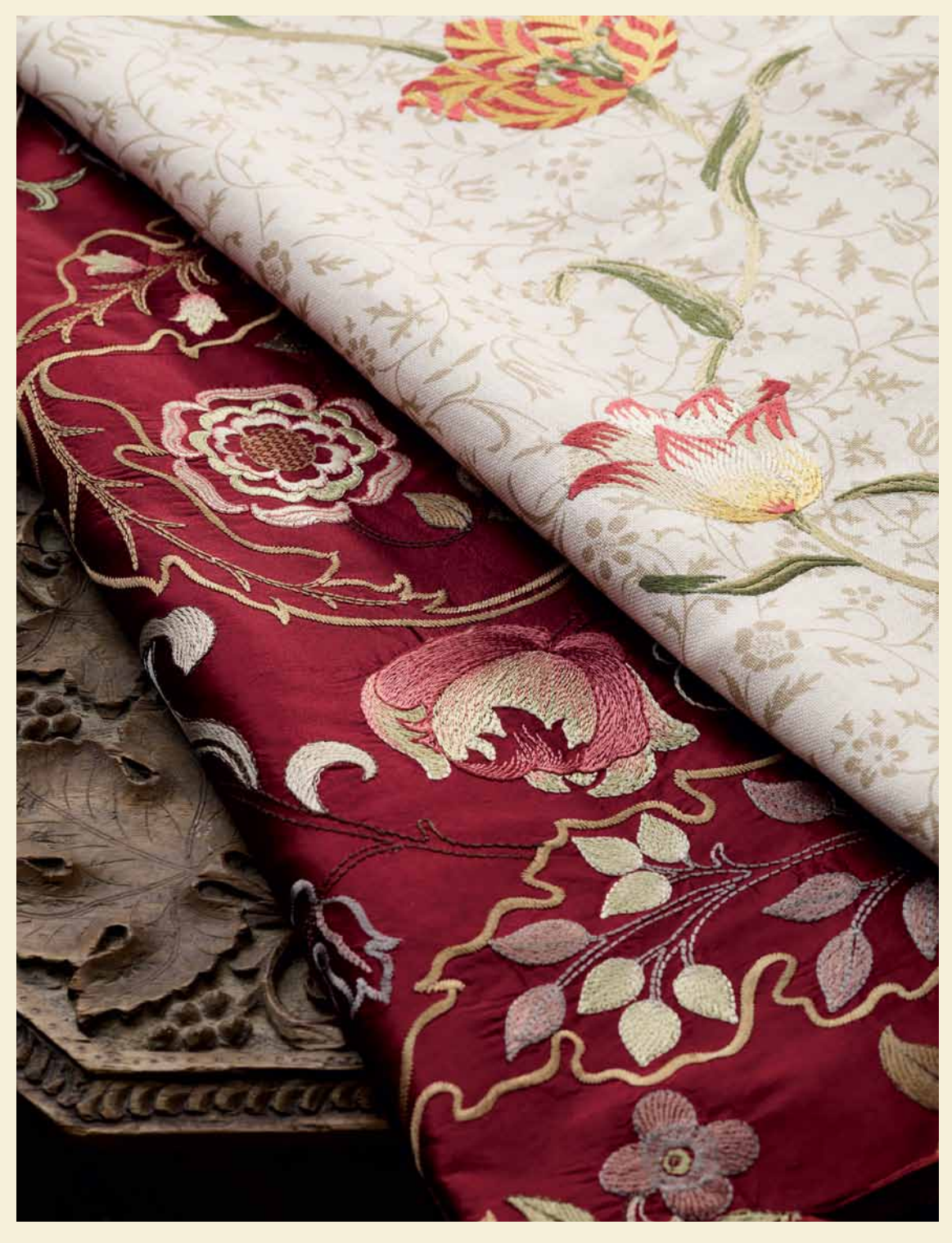
ABOVE FROM LEFT Mary Isobel (silk) 230338, Garden Tulip 230336 RIGHT CURTAIN & CUSHION Mary Isobel 230340

"If I were asked to say what is at once the most important production of Art