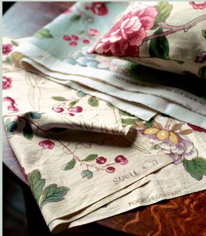
CUSHION: Tangley DMCOTA203

THE HAND-CRAFTED feel and unique style for which Morris is known and loved has been maintained and developed; unusual engraving techniques and earthy colours have been applied to give a bolder, less traditional feel, making this a collection to be used in both period and modern interiors.