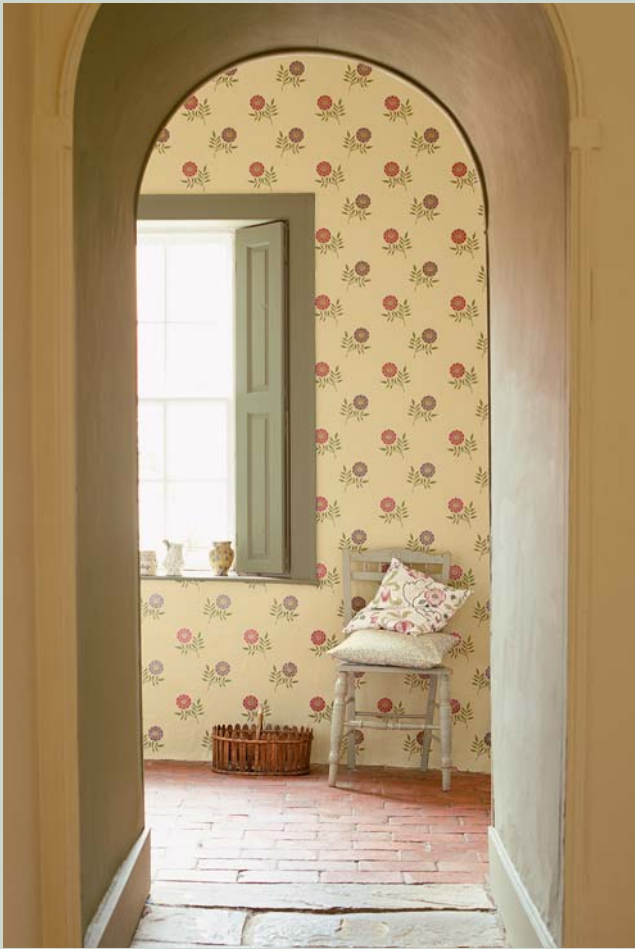
WALLPAPER: Morris Rose DMOWMO103 PAINT: (On shutter and inside arch) Olive PAINT: (On wall) Tempera Cream CUSHIONS: Mary Isobel DMCOMA204 and Lily Leaf DMCOLI205