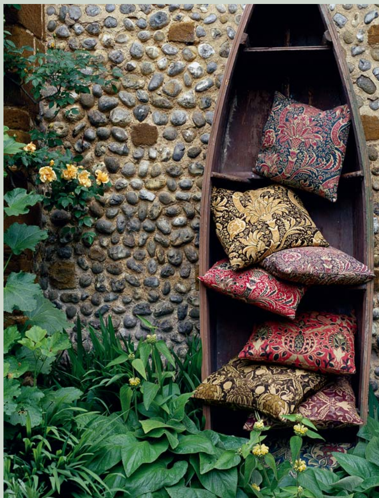
CUSHIONS: (From top) Indian DMCOIN201, DMCOIN202, DMCOIN204 and DMCOIN203 Granada DMCOGR203, DMCOGR202, DMCOGR204 and DMCOGR201

HONEYCOMBE an early 18th century reproduction that sits well with the larger patterns.