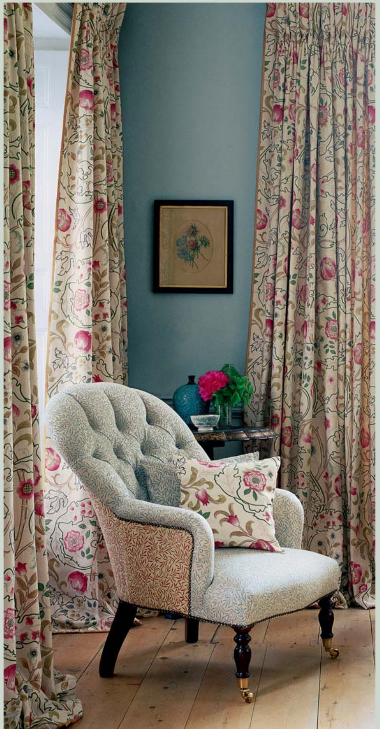
CURTAINS: Mary Isobel DMCOMA204, trimmed in Lyric DLYRLY350 CHAIR: (Inside) Lily Leaf DMCOLI206, (Outside) Lily Leaf DMCOLI202 CUSHIONS: (FROM LEFT) Lily Leaf DMCOLI205, Mary Isobel DMCOMA204 PAINT: Slate