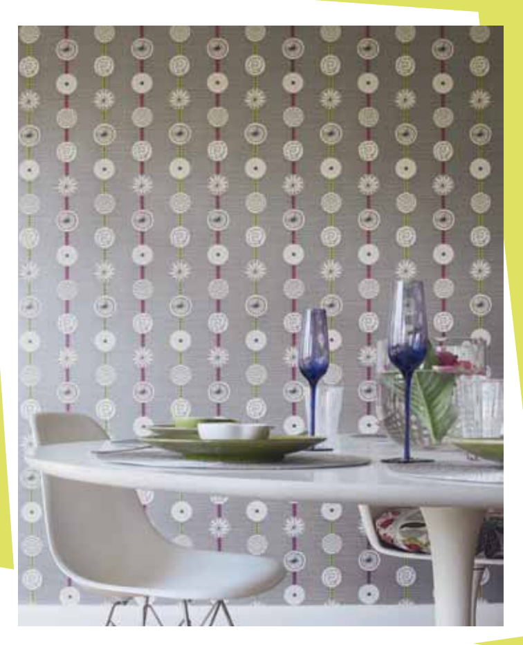
LEFT WALLPAPER Atomic 210236 RIGHT WALLPAPER Miro 210228 DRESS Mobiles 220033 waistband Lyric DLYRLY380

The Sanderson 50s collection combines original 1950s designs from the Sanderson archive with patterns from contemporary artists who have taken inspiration from this era.